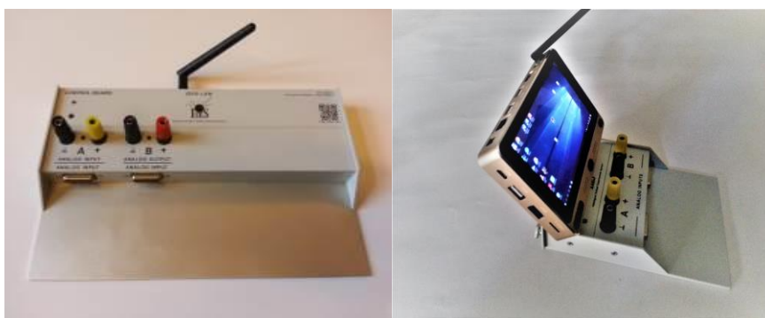
Fig. 1. New measure systems ISES-LAN and ISES-WIN

Modular system iSES (internet School Experimental Studio) communicates with different measurement platforms. The newest system ISES-LAN and ISES-WIN includes a PC with Windows 10 operating system (not Arduino, Raspberry Pi etc.). Both feature 2x analog input, 1x analog output channel, 5x digital outputs/inputs with sampling frequency of 100 kHz. Software “iSES Remote Lab SDK“ can handle up to 4 ISES-LAN or ISES-WIN units..