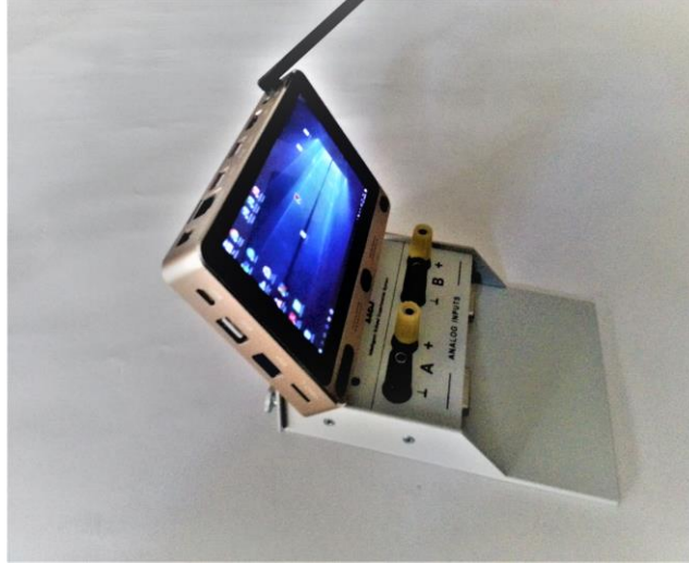
Fig. 1. New measurement system ISES-WIN