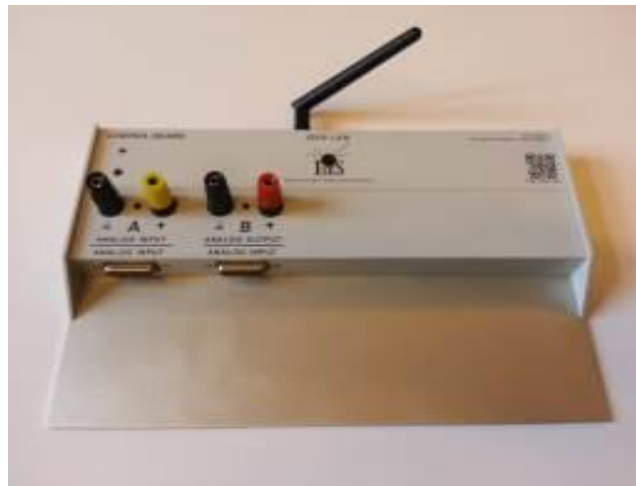
Fig. 2. New measurement system ISES-LAN