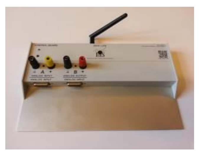
Fig. 2. New measurement system ISES-LAN